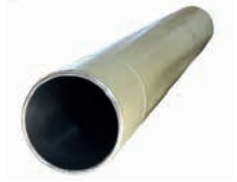
SD-088 | Delivery Cylinder 230x2100