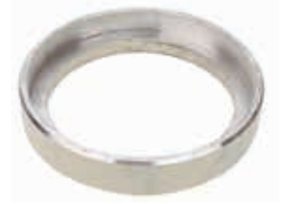
SD-058 | Wearing (PM)