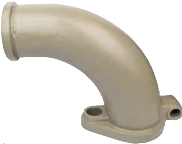
SD-014 | Tapered Bend DN180/150 90 Degrees (Schwing)