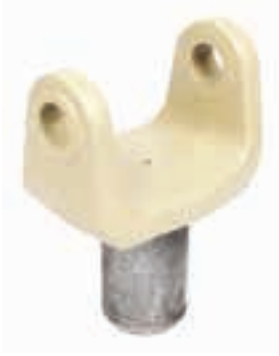
SD-077 | Slewing Pivot (Schwing)