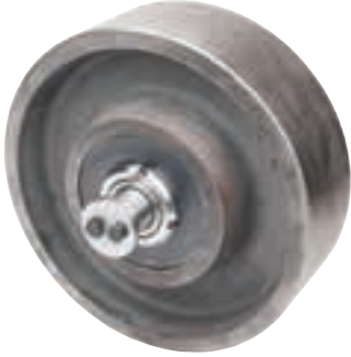
SD-095 | Roller 280x110 Complete