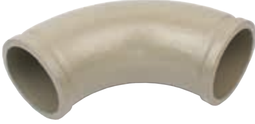
SD-041 | Elbow 90 Degree R190