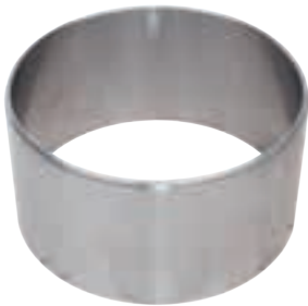
SD-062 | Wear Sleeve (PM)