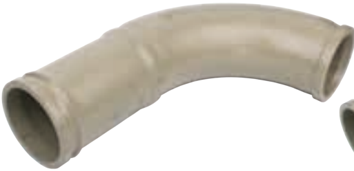
SD-021 | Elbow 90 Degree with 34 cm 5.5" (Schwing)