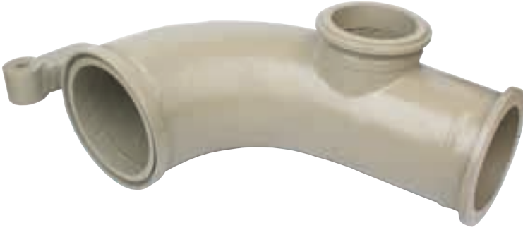
SD-012 | 1. Outlet Elbow 7" - 6" (Cifa)