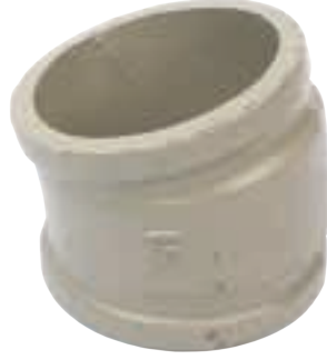
SD-002 | Elbow 15 Degree 5.5"