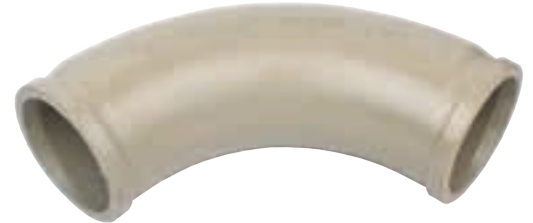
SD-009 | Elbow 90 Degree 5.5"