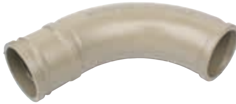
SD-019 | Elbow 90 Degree with 10 cm 5.5" (Schwing)