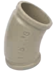
SD-031 | Elbow 36 Degree (Cifa)