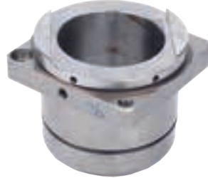
SD-060 | Complete Upperhousing Ø90 Support Flange (PM)