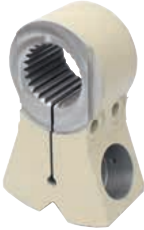
SD-068 | Slewing Lever Ø90 (PM)