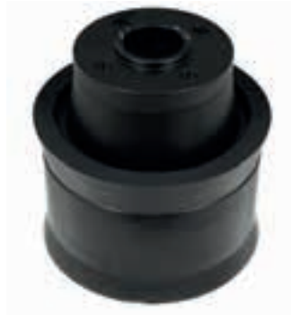
SD-071 | Piston Ram DN200 (PM)