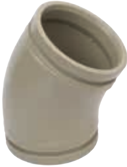
SD-029 | Elbow 6" 45 Degree (Schwing)