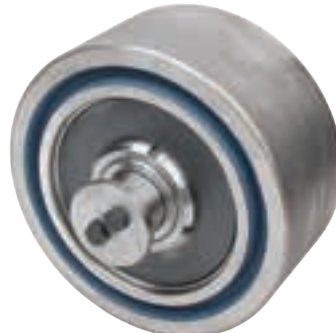
SD-099 | Roller 250x160x90 Complete