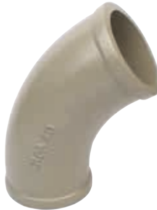
SD-030 | Elbow 60 Degree (Cifa)