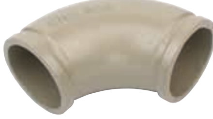
SD-042 | Elbow 90 Degree Short (Cifa)