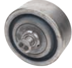
SD-094 | Roller 220x110 Complete