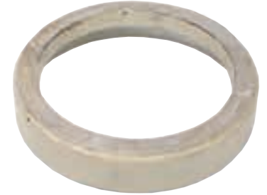
SD-061 | Wearing (PM)