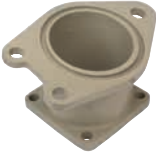
SD-018 | Connection Bend DN180 14 Degree (Schwing)