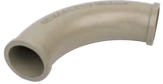
SD-034 | Elbow 4.5" 45 Degree