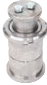
SD-093 | Pin and Perno Set 160