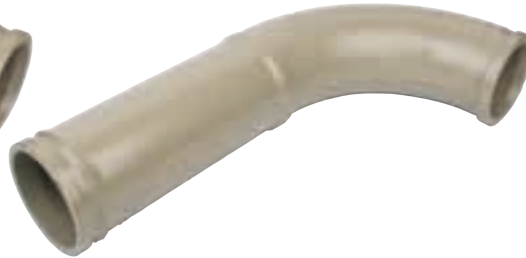
SD-022 | Elbow 90 Degree with 43 cm 5.5" (Schwing)