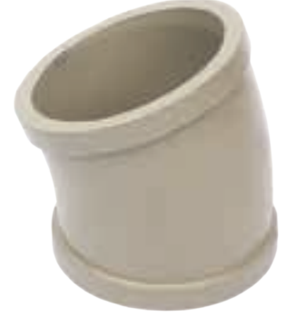
SD-003 | Elbow 20 Degree 5.5"