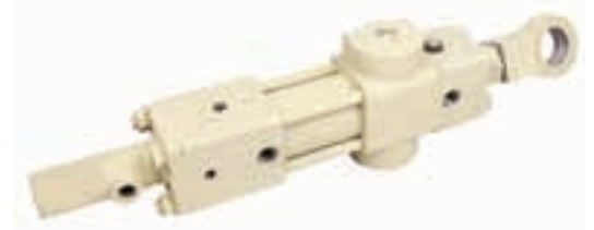
SD-076 | Slewing Cylinder (Schwing)