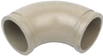
SD-007 | Elbow 90 Degree Short Type (180)