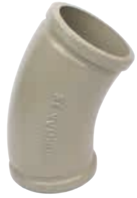
SD-037 | Elbow 35 Degree (Sermac)