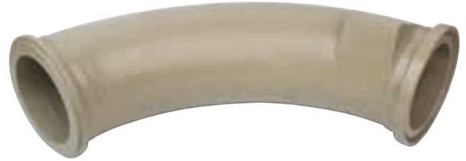
SD-013 | 2. Outlet Elbow 6" (Cifa)