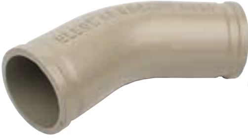
SD-032 | DN125 5.5" Ergonic Elbow