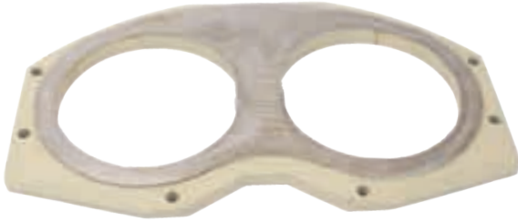
SD-059 | Spectacle Wear Plate (PM)