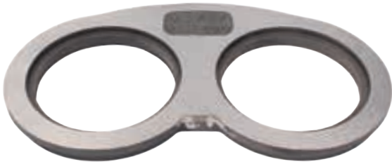
SD-080 | Wearing Insert DN200 (Schwing)