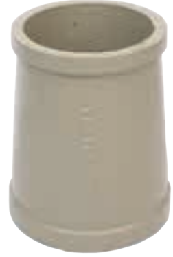
SD-028 | Reducing Pipe 200 mm (PM)