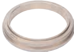
SD-081 | Wearing Insert DN210 (Schwing)