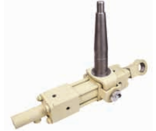
SD-079 | Slewing Cylinder (Schwing)