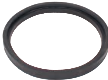
SD-063 | Thrust Ring with Steel (PM)