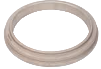
SD-085 | Cutting Ring DN220 (Schwing)