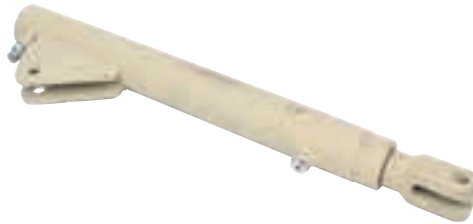
SD-090 | Hydraulic Cylinder