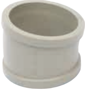
SD-001 | Elbow 10 Degree 5.5"