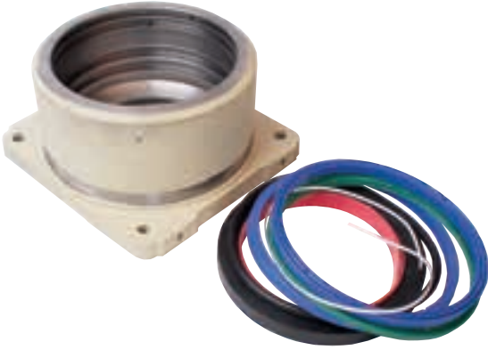
SD-065 | Discharge Support (PM)