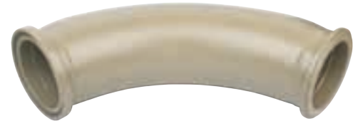
SD-023 | 2. Outlet Elbow New Type (Sermac)