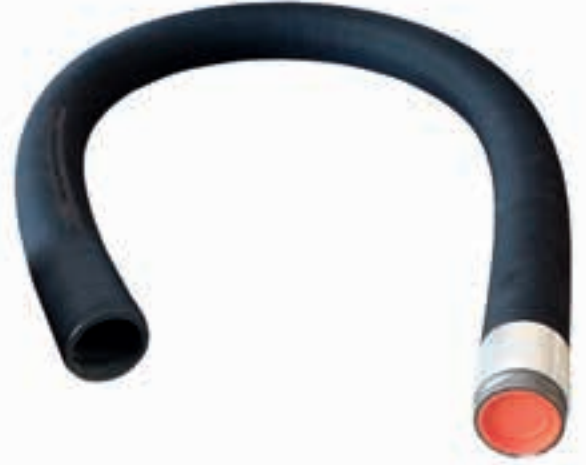
SD-107 | Single Flange 5.5" 3 mt, 4 mt, 6 mt Hose