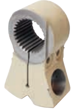
SD-067 | Slewing Lever Ø80 (PM)