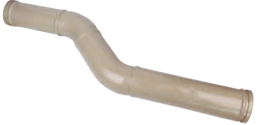
SD-025 | S Pipe