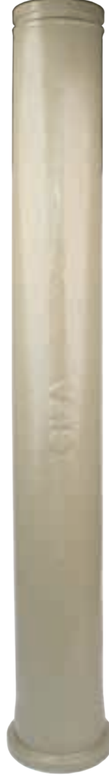
SD-046 | Reduction Pipe 1286 mm (Cifa)