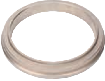
SD-083 | Cutting Ring DN230 (Schwing)