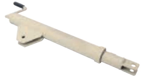
SD-091 | Chut Handle Mechanic