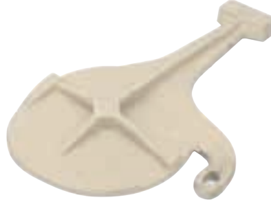
SD-066 | Slide (PM)