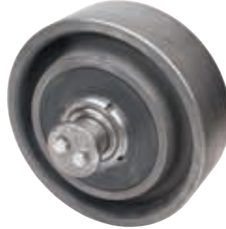
SD-096 | Roller 280x160x90 Complete