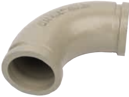
SD-035 | Elbow 4.5" 90 Shart R180