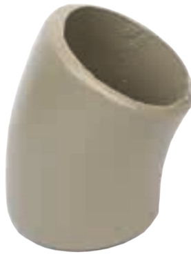
SD-039 | Elbow 6" 32.5 Degree (Schwing)