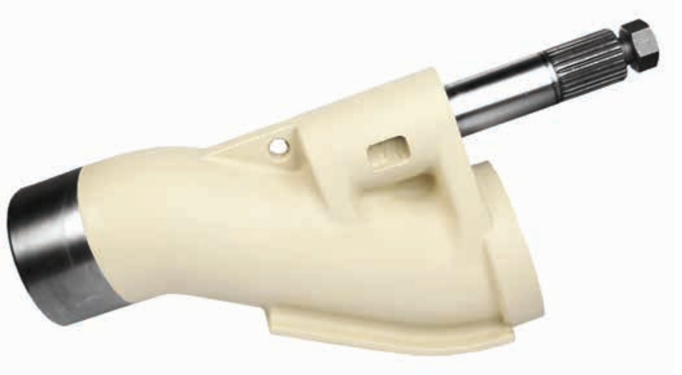
SD-054 | S Valve 2018N Ø80 (PM)