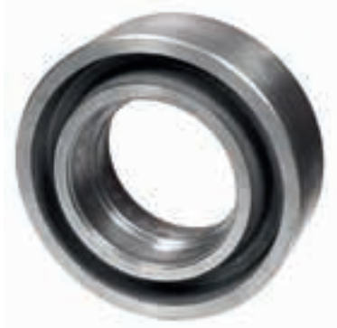
SD-105 | Roller 245x130x120 External