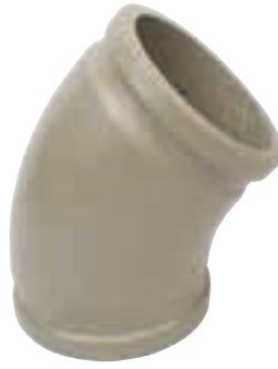
SD-036 | Elbow 30 Degree (Cifa)