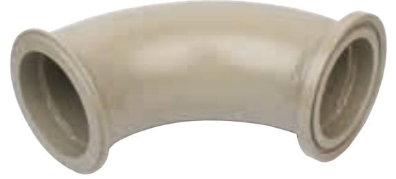
SD-011 | 6" Elbow (PM)