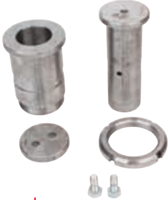
SD-092 | Pin and Perno Set 130