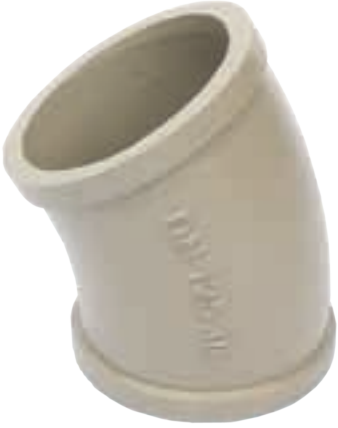
SD-004 | Elbow 30 Degree 5.5"