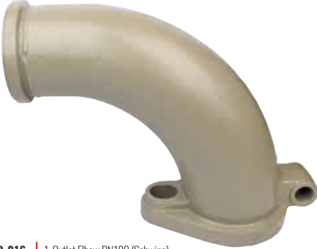
SD-016 | 1. Outlet Elbow DN180 (Schwing)