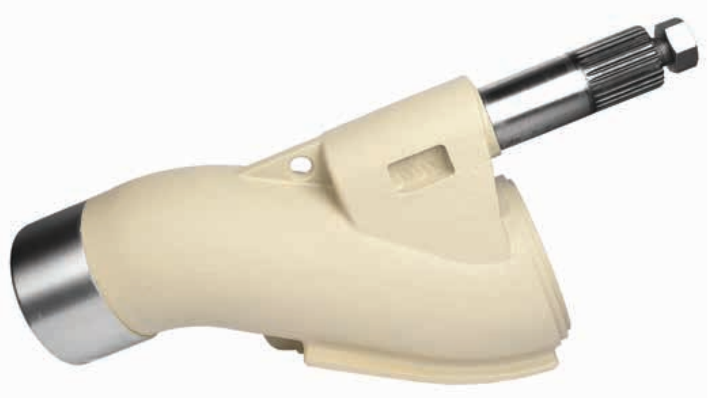
SD-055 | S Valve 2318N Ø90 (PM)