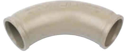
SD-006 | Elbow 90 Degree 5.5"