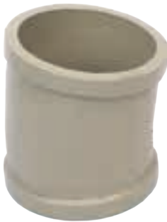
SD-038 | Elbow 9 Degree (Cifa)