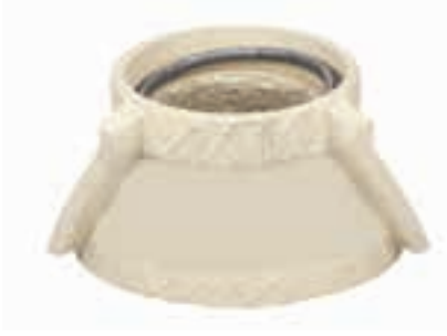
SD-074 | Rock DN210-180 (Schwing)