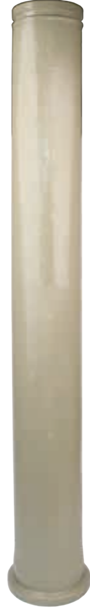
SD-047 | Reduction Pipe 1400 mm (200Line)