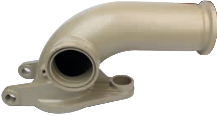
SD-010 | Foldable Elbow (PM)