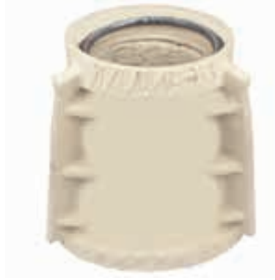
SD-075 | Rock DN220-180 (Schwing)