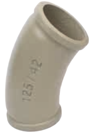
SD-040 | Elbow 42 Degree (Cifa)