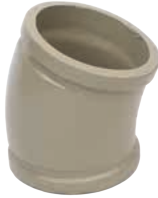
SD-027 | Elbow 6" 50 Degree (Schwing)