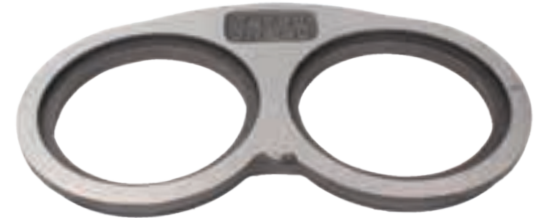
SD-082 | Wearing Insert DN230 (Schwing)