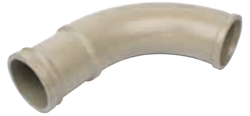
SD-020 | Elbow 90 Degree with 20 cm 5.5" (Schwing)