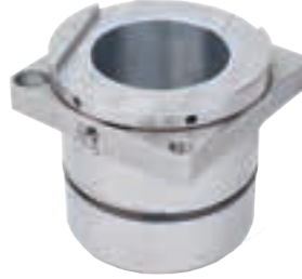
SD-057 | Complete Upperhousing Ø80 Support Flange (PM)