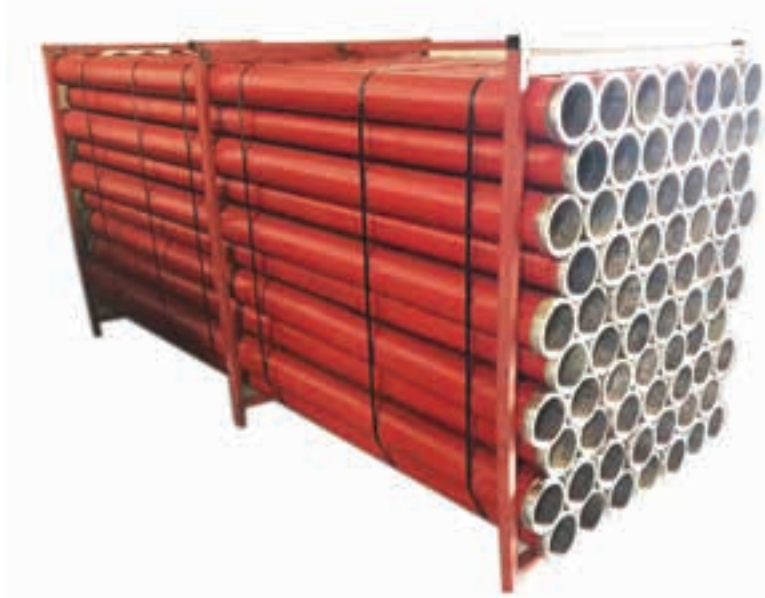
SD-108 | Delivery Pipe 3 mt 5.5"