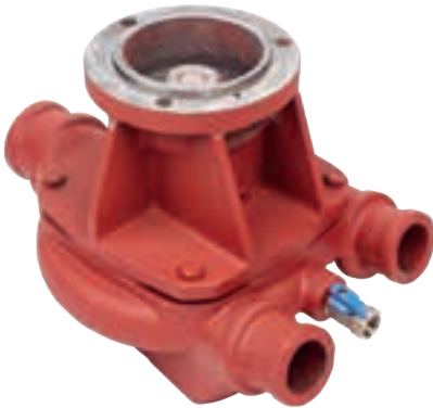
SD-089 | Water Pump Double Breaking LT Type