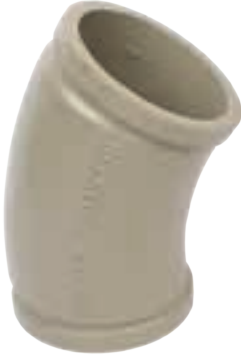
SD-026 | Elbow 5.5" 32.5 Degree (Schwing)