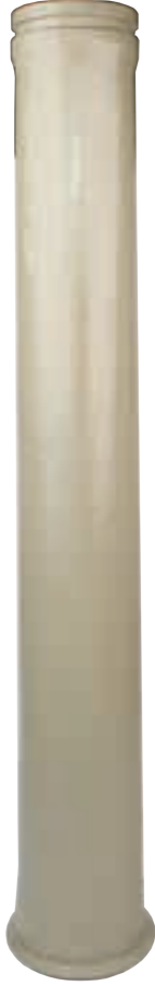
SD-045 | Reduction Pipe 1200 mm (PM)