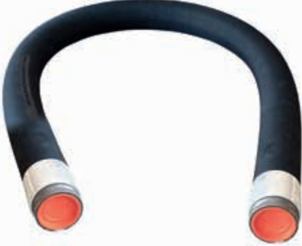
SD-106 | Double Flange 5.5" 3 mt, 4 mt, 6 mt Hose