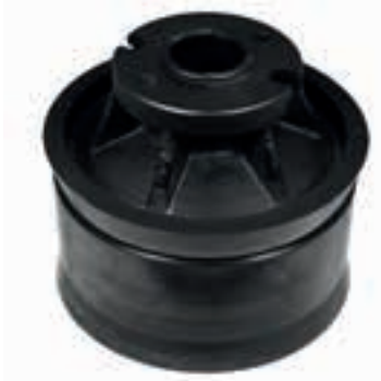
SD-072 | Piston Ram DN230 (PM)