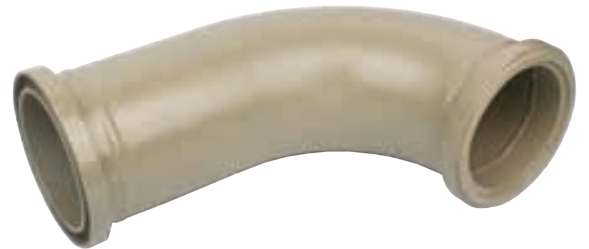
SD-015 | Elbow 150 Degrees (Schwing)