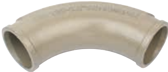
SD-008 | Elbow 90 Degree Assisted 5.5"