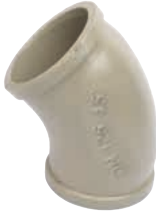
SD-005 | Elbow 45 Degree 5.5"