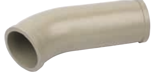
SD-043 | Elbow 5.5" 45 Degree Long (PM)