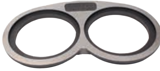
SD-084 | Wearing Insert DN250 (Schwing)