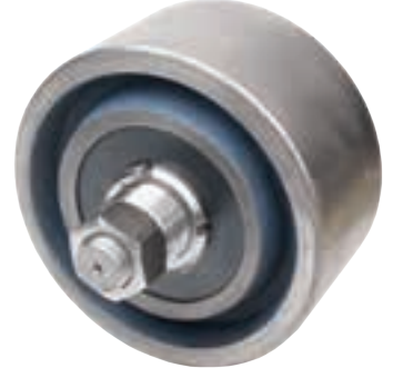
SD-103 | Roller 245x130x120 Complete