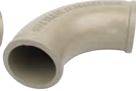
SD-033 | Elbow 90 Degree R240 (Cifa)