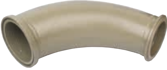
SD-024 | 1. Outlet Elbow Olo Type (Sermac)