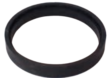
SD-064 | Thrust Ring (PM)